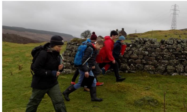
Here the students undertake pacing out of the site, recording the findings as they go